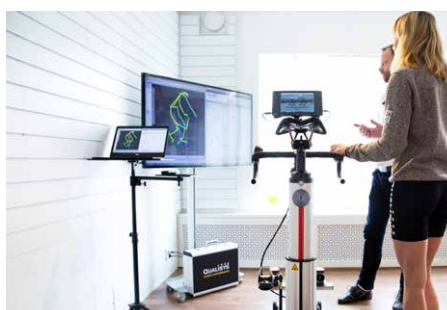
Visualize movements in QTM software.