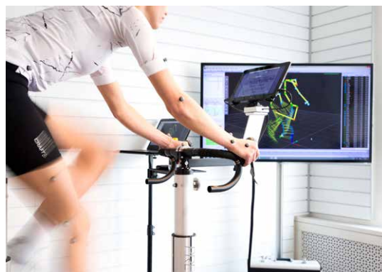
Streamlined data collection in QTM

The software guides you through the data collection steps and allows you to enter additional information that will appear in the report, and when you are done, simply click a button to generate a comprehensive report.