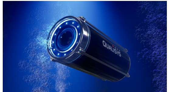
Miquis Underwater cameras are ideal to use in small to medium sized volumes, up to 15m (45ft) range.

Use the Underwater Miquis Video as a standalone video solution, or together with motion capture cameras to enable synchronized 3D video overlay as reference for your captures. Thanks to the multi-camera synchronization of all Qualisys cameras and the embedded MJPEG compression in the Miquis underwater video cameras, it is simple to stream full HD color video at 85 fps from multiple cameras to an ordinary laptop.