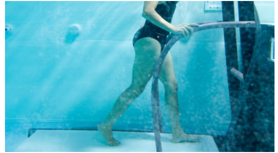
Wide angle lens options allow for close captures in small volumes, which is typical for in-water gait analysis.

Motion capture has been used for decades to facilitate rehabilitation by providing objective data on the subject's motion. With Qualisys underwater cameras, this possibility now also exists for in-water rehabilitation using underwater treadmills. The small and wide-angle Miquis cameras are perfect in small pools with short distances from pool wall to the subject.